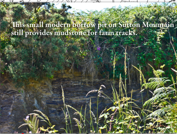
This small modern borrow pit on Sutton Mountain still provides mudstone for farm tracks.