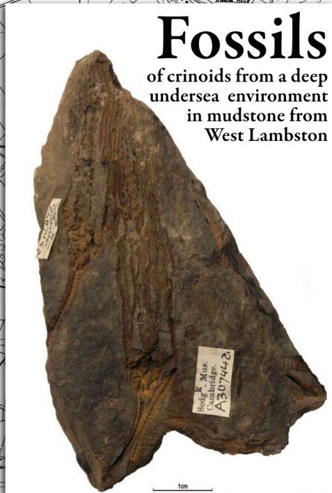
Fossils of crinoids from a deep undersea environment in mudstone from West Lambston