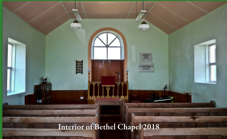
Interior of Bethel Chapel 2018