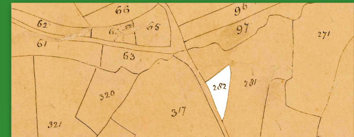
The triangular plot of land selected for the building of Sutton Baptist Chapel.

In 1952 the chapel still drew on 6 different parishes for Deacons and had 73 members. Today the chapel has a rather smaller membership and is still linked with Camrose Baptist Chapel. There is a meeting every Sunday at 11.30 at which all are welcome.